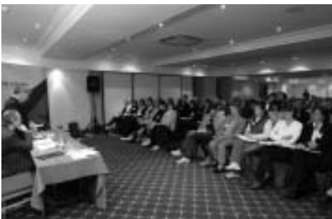
Consultation seminar for National Action Plan

The written stage of the consultation process was followed by a series of seven regional and national seminars organised by the Office during November and December 2005 in Dublin, Carlow, Cork, Limerick, Mullingar, Carrick on Shannon and Donegal. The seminars were designed to facilitate the participation within the NAP/inclusion process of people with direct experience of poverty and social exclusion and those who work with them. A total of 512 people attended the seminars countrywide.