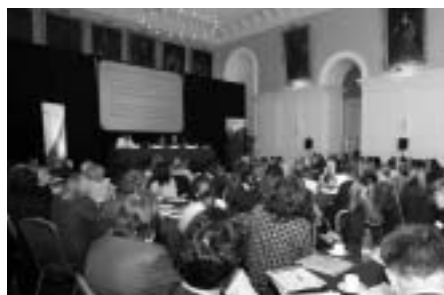
Social Inclusion Forum