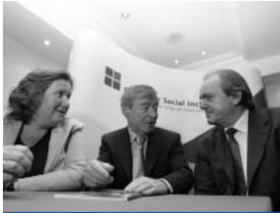
Consultation seminar for National Action Plan

The consultation process for Ireland's next National Action Plan against Poverty and Social Exclusion (NAP/inclusion) 2006-2008 commenced in September 2005, with newspaper advertisements in the national media seeking written submissions from organisations and individuals on the broad objectives and policy measures to be reflected in the Plan. Guidelines to assist in the preparation of views were available from the OSI. Submissions were also invited via the OSI website - www.socialinclusion.ie .