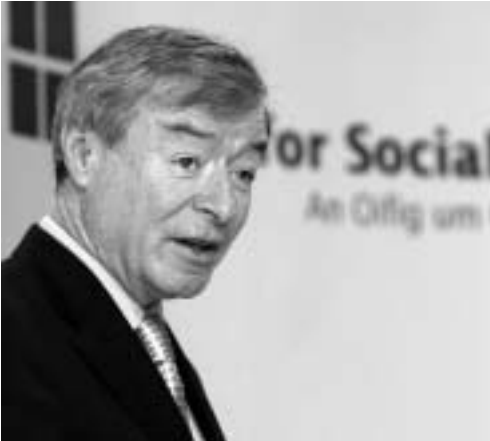
Minister Seamus Brennan

Tackling poverty is not just a matter for the State, but for society as a whole. The National Action Plan against Poverty and Social Exclusion (NAP/inclusion) recognises therefore that there is a need for effective ongoing communication on the trends and challenges in relation to poverty and on the ongoing process for tackling it, both within Government and between Government and all stakeholders.