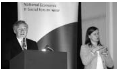
Minister Seamus Brennan, Social Inclusion Forum